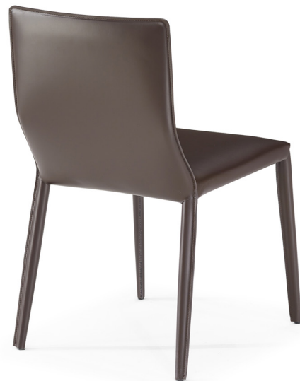
■ C008KMV / C008KM0 (2 pcs)