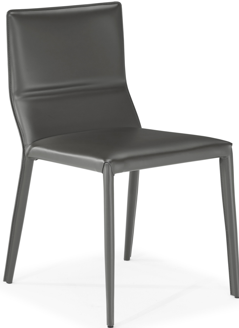
■ C008KGV / C008KG0 (2 pcs)