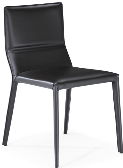
■ C008K5V / C008K50 (2 pcs)